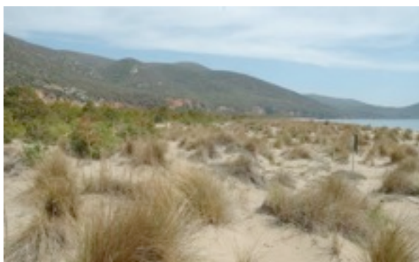
Fig. 1. Coastal dune vegetation (Parco dell’Uccellina)

We detected significative differences in abundance and species composition between EUNIS habitat types, between SACs, and between habitat types within SACs. In particular, our data shows particular differences between communities of north and south of Tuscany: the northern SACs to Serchio river are heavily impacted by the presence of mass tourism, with bathing establishments, roads and human trampling. From these evidences can be deduced that trails installed within the DUNETOSCA Life Projects and aimed to reduction of tourism impact may be insufficient to reduce anthropic pressures in those contexts and adequate conservation strategies are required.