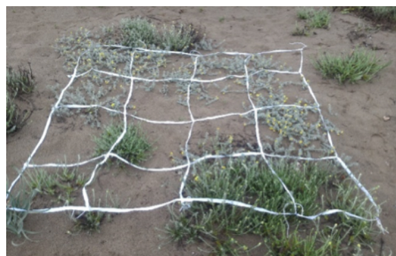
Fig. 2. Plot of 2 x 2 m for floristic surveys