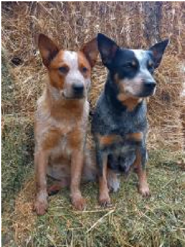
Fig. 1 Photo of the Australian Cattle Dog with the two coat colors: on the left "Demetra"(red) and on the right its grandmother "Spader Tess" (blue). (color figure online)

The Standard (FCI Standard No. 287/05.09.2013) reports a height at the withers of about 46–51 cm for males, and 43–48 cm for females. The coat colors permitted include two typical colors, red or black and tan ('blue') with varying degrees of mottling and/or speckling (Fig. 1). Blue dogs can be blue, blue mottled, or blue speckled always with tan and with or without black markings. Red dogs are evenly speckled with solid red markings. Both red dogs and blue dogs are born white (except for any solid-colored body or face markings) and the red or black hairs grow as they mature. The distinctive adult coloration is the result of black or red hairs closely