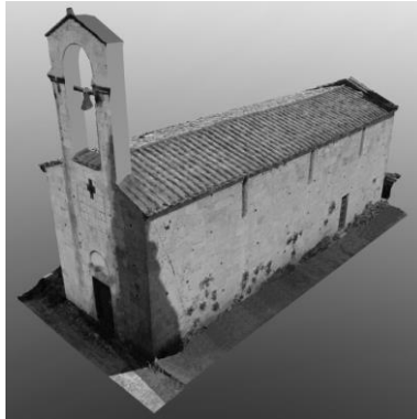
Figure 4. Render of the church from integrated surveys