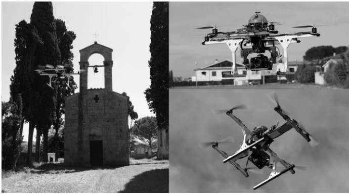
Figure 1. UAV capturing the façade of the church.

In order to correctly plan a restoration intervention a good survey is mandatory in the preliminary study. The methodologies currently used in the architectural survey allow to obtain highly accurate three-dimensional models, in both geometric and morphologic viewpoints, and a good quality color information. In literature (e.g. Guidi, G., Russo, M. y Beraldin, J.A., 2010, Koska, B. y Křemen, T., 2013, Wenzel, K., Rothermel, M., Fritsch, D., Haala, N., 2013), descriptions of numerous investigations are found, showing that, using and combining terrestrial laser scanning and photogrammetry, the achievement of highly accurate models with photorealistic textures is relatively easy.