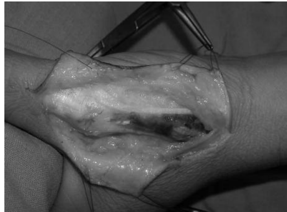
Figure 2. Intraoperative view: The proximal and distal ends of the EPL tendon are visualized. Note the degenerative appearance of the tendon.

tion exercises were started and at three months the patient regained full range of motion and normal grip strength (Figure 4).