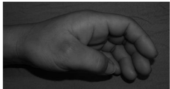
Figure 5. A picture of a hand, showing the usual site of injection. Note the close proximity of the flexor pollicis longus tendon to the extensor pollicis longus tendon. FPL (flexor pollicis longus), EPL (extensor pollicis longus), epb (extensor pollicis brevis).

In the absence of a clear etiology for rupture of the extensor pollicis longus in this patient, the proximity and temporal relationship of steroid injections into the palmar aspect of the thumb could create a potential explanation for this rare phenomenon. We are reminded that although steroid injections for treatment of flexor tenosynovitis may be a relatively benign event, improper administration could lead to serious consequences such as complete rupture that could require a surgical procedure followed by an inability to use the hand during the period of immobilization and physical rehabilitation.