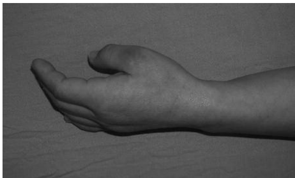
Figure 1. Preoperative view: the patient was unable to extend the thumb.

Histological examination of the specimens showed disrupted collagen bundles and areas of necrosis in the stumps of the tendon. (Figure 3). Polarised light showed diffused pale foreign bodies consistent with steroid related debris. After splint removal, passive then active range of mo-