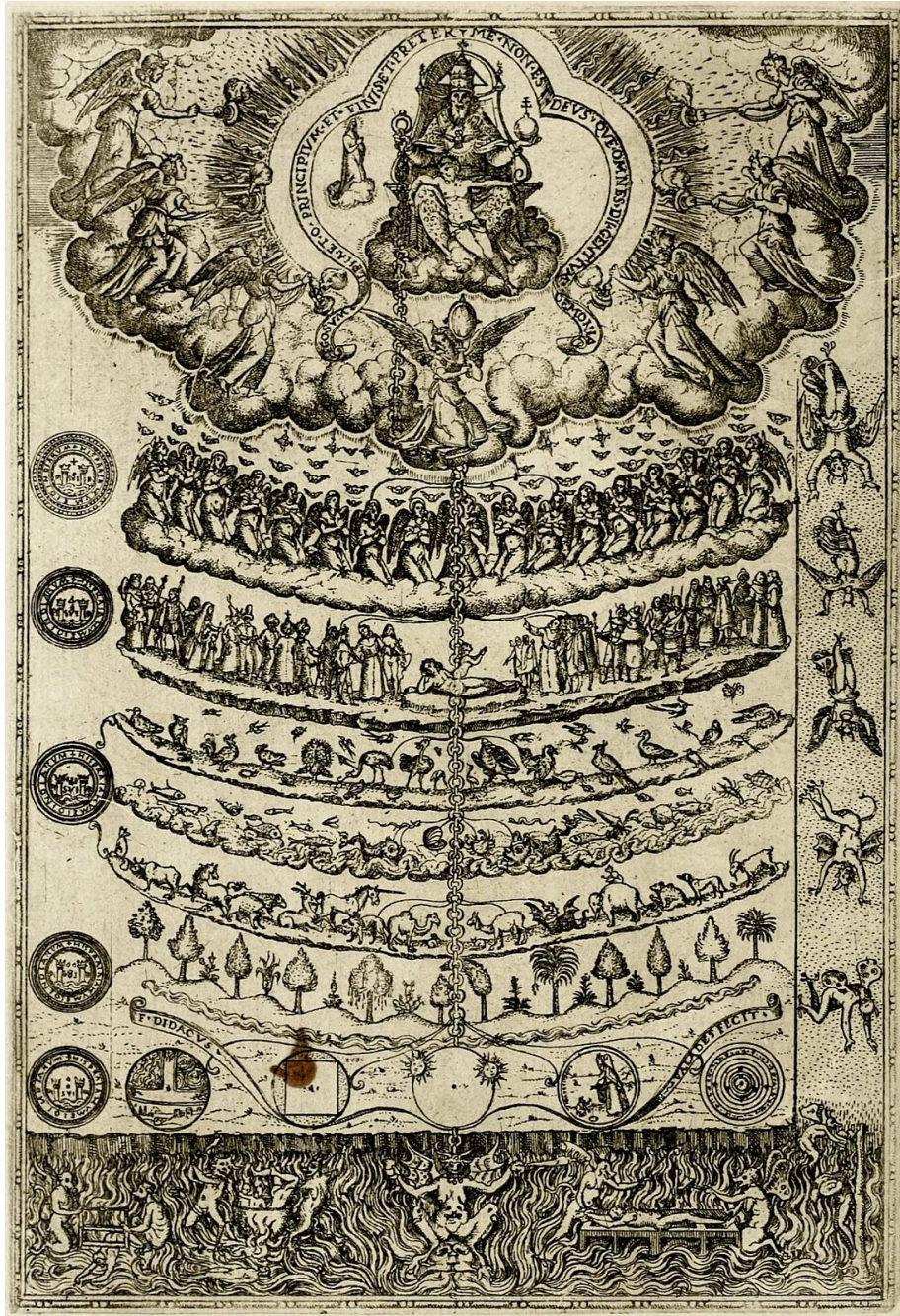
Figure 1: Scala naturae

all species implies that all traits which we consider uniquely human, from intelligence to emotions, to the ability to communicate, to attachment to loved ones, are actually shared with other animals.