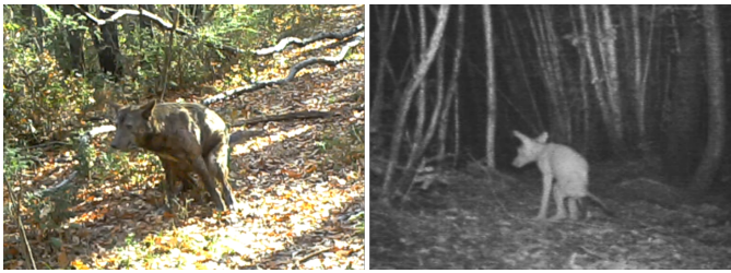
Figure 2 – The adult reproductive female recognizable by the presence of a black coat (left) and a pup with evident skin disease attributable to mange ectoparasites infestation (right) while defecate in a marking site and in the rendez-vous site, respectively.

“Video-scat” analysis was also used as additional wolf scat identification tool (Fig. 2). For a subsample of scats ( n=4 of pups and n=23 of adults) identification of pure wolf individual was confirmed (100%) through DNA genotyping (Coppola et al., 2022 and unpublished data).