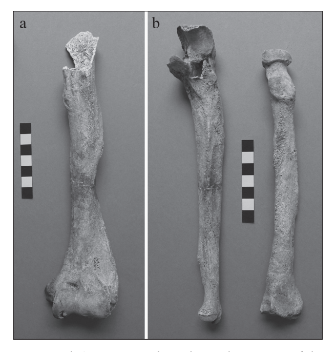
Figure 4. a) Camurati-Engelman disease: hyperostosis of the left humerus; b) left radius and ulna

A mature male aged 45-55 years (US 2179), with a stature of about 165 cm, was affected by a sclerosing bone dysplasia, as the general thickening of several districts demonstrated. The skull bones are poorly preserved, but a severe thickening can be appreciated, whereas the mandible is normal. The long bones of upper and lower limbs are characterized by a hyperostosis of the diaphysis with increased and irregular cortical thickening, whereas the epiphyses are normal (Figs. 4a-4b-4c, 5a-5b-5c). The differential diagnosis allowed to diagnose a case of Camurati-Engelmann disease, a genetic disorder characterised by increased bone density (13).