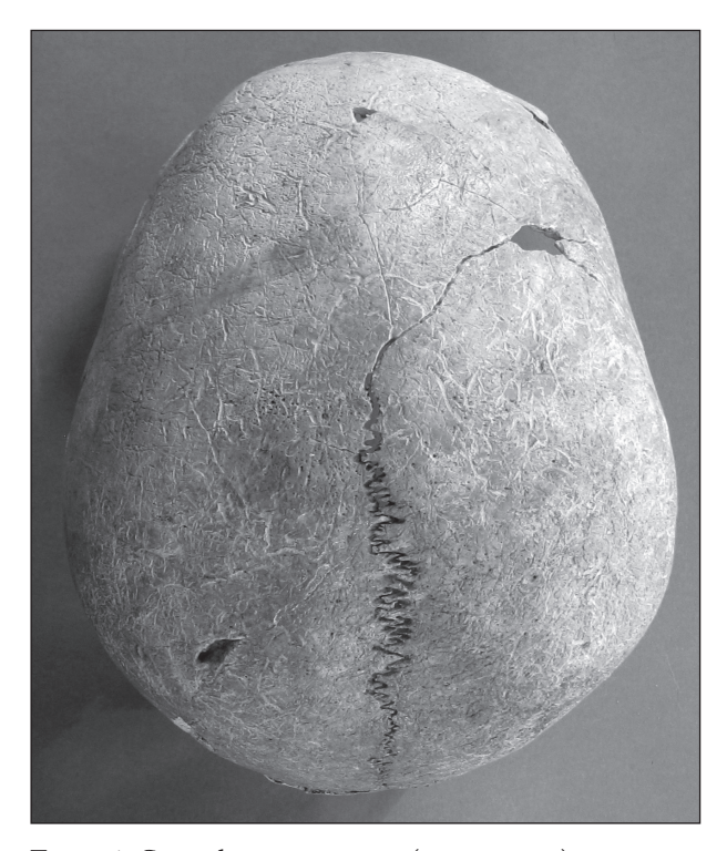
Figure 1. Coronal craniosynostosis (superior view)

In a male aged 20-30 years old (US 2219) the first cervical vertebra shows a defect of the posterior arch, which exhibit a failure of the midline fusion of the two hemiarches with a small gap (Fig. 2b). Ac-