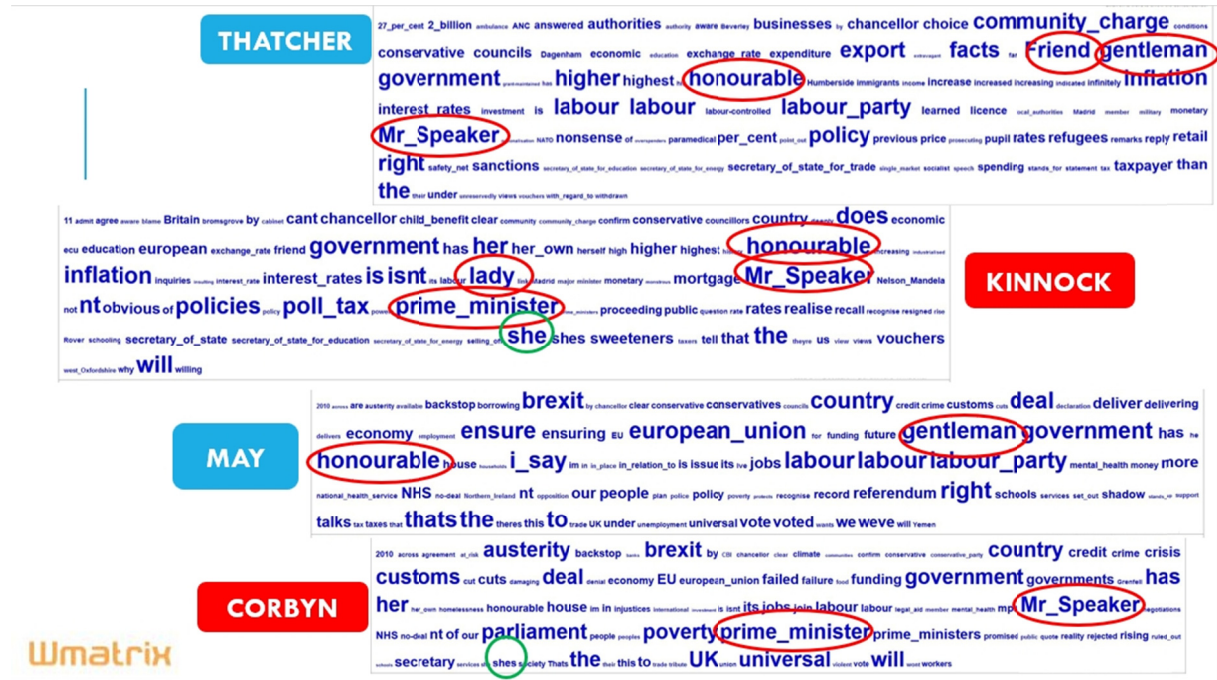
Figure 3. Word clouds

Focussing specifically on forms of address and formulaic expressions, some comparisons can be made between the two women leaders and between their respective nemeses. Thatcher often uses the title Mr Speaker at the beginning of her turn (69 occurrences) and its variant Mr Speaker, Sir , while May hardly ever uses it (only 4 occurrences). When addressing the LO, both Thatcher and May generally maintain the “third person” rule of address and use the honorific Right honourable Gentleman (96 and 302 occurrences, respectively). In May’s case, it is often preceded by the formulaic expression ...say to the Right honourable Gentleman (106 occurrences) in all of its variants such as Can I (just) say... / I (really) have to say... / I (also) say to... / I would (also) say to... / Let me say... However, on two occasions both Prime Ministers address their respective LO directly with the second person singular pronoun you (cf. examples in Section 5.2), thus violating the politeness norm imposed in this institutional context.