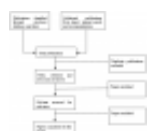
Table des illustrations

1 This paper is based on a survey addressing the latest developments in ECME that was initiated in the context of the 14th International Congress on Mathematics Education (ICME-14) and a part of the findings of the survey were presented at the conference on July 18, 2021