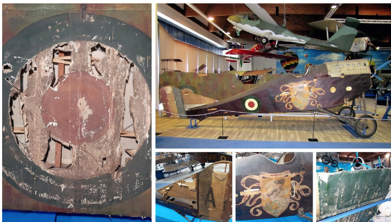
Figure 2. State of conservation of the Ansaldo A.1 Balilla in 2020 before the conservation campaign.

Analytical pyrolysis coupled with gas chromatography and mass spectrometry (Py-GC-MS) was used to characterize both the origin of the fabric and the dope (SI–S3). Pyrolysis markers characteristic of silk were detected, with diketopiperazines and phenol derivatives as the most abundant species 5 . Cotton was the material