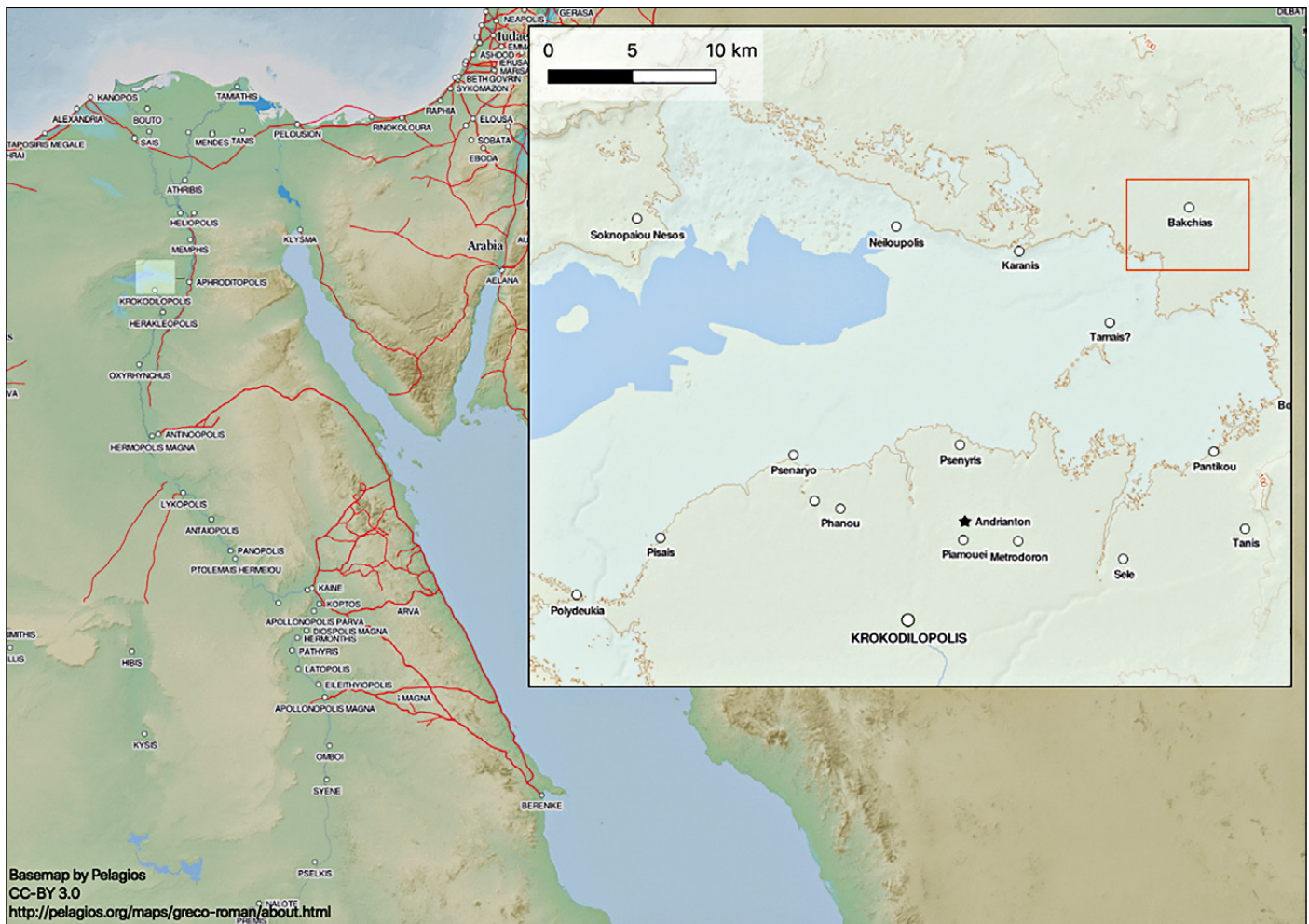
Fig. 8.1 – The Fayyūm area (Elaboration by J. Bogdani).

lake in the dynastic epoch, at the intersection with the northern slope which linked the region with the Nile Valley and Memphis. The location must therefore have been extremely attractive to the ancient population when choosing a site. It is not surprising that other centres in the region located on this raised plateau, such as Shedet/Arsinoe (Madīnat al Fayyūm), or Gia/Narmouthis (Madīnat Mādī), and Tebtynis (Umm al-Burayġāt), preserve important remains from the dynastic epoch 4 .