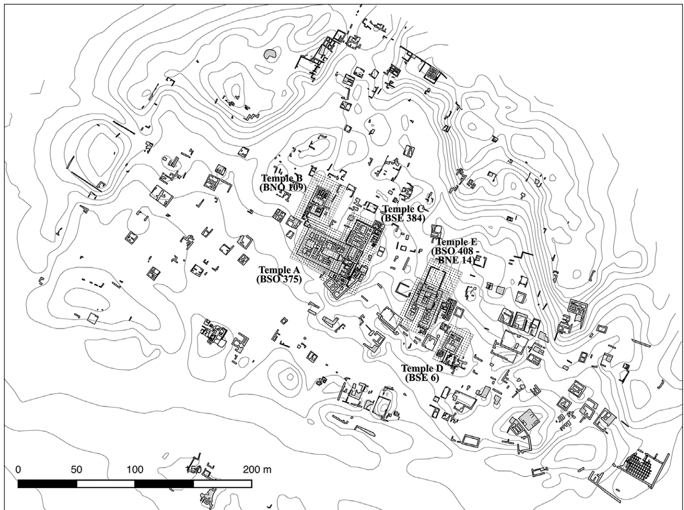
Fig. 8.3 – The two sacred areas and the temples of Bakchias.

a production place; this information can be obtained on the basis of palaeographic analysis, codicological examination or even textual evidence 22 . Books are a precious (and rather expensive) good and, as such, displacements and safekeeping locations are sometimes worth registering in paratexts (mainly colophons). These storage places too are being carefully filed, in the attempt to retrace on the geographical map the circulation of these very