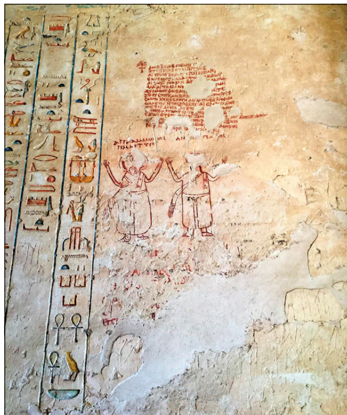
Fig. 8.5 – Coptic graffito showing two crudely painted saints with upraised arms standing below the text of a prayer; north wall of the entrance corridor of KV 2 (Ramses IV), Valley of the Kings. The pharaonic tomb was reused as a chapel dedicated to Saint Ammônios and perhaps saint Abraham.

1) A complete catalogue of temples, but also of chapels and burials, dated to pharaonic and Ptolemaic-Roman ages, which have