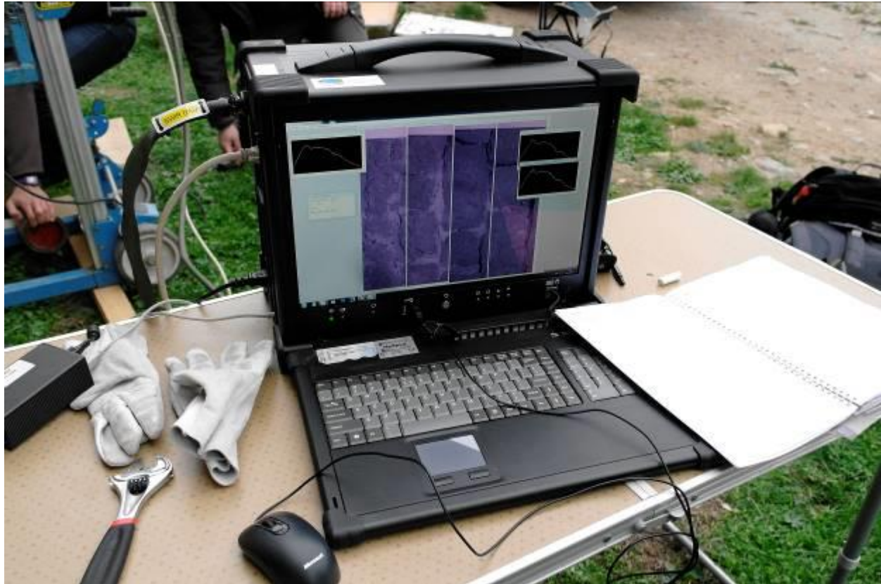
Figure 2_ SWIR images visualized on the laptop in real time during data acquisition (Carcassonne project)

elemental analysis. The application of NIR to archaeological research makes it possible to collect big datasets in short time (Allios et al. 2016, Linderholm et al. 2015). The first field test application of the NIR probe for the study of rock paintings allowed the collection of 1432 spectra in the near infrared within working five days and from six different sites (Linderholm et al. 2015). The time for each measurement is about 1-2 seconds and there is no limit to the number of records. The data collected with the Micro probe are stored as data matrix files in which the variables/wavelengths are reported. The spectra can be visualized on the laptop/tablet in real time during the acquisition.