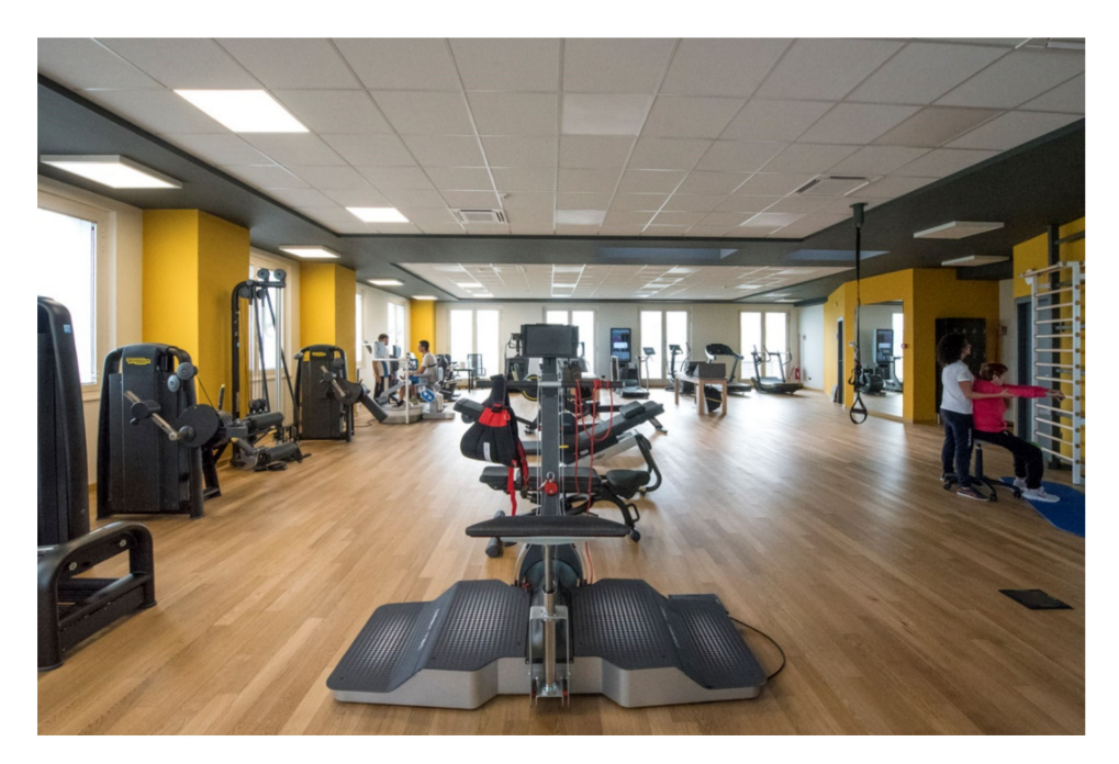
Figure 2. Gym of the Center for Physical and Rehabilitation Medicine "Sport and Anatomy".