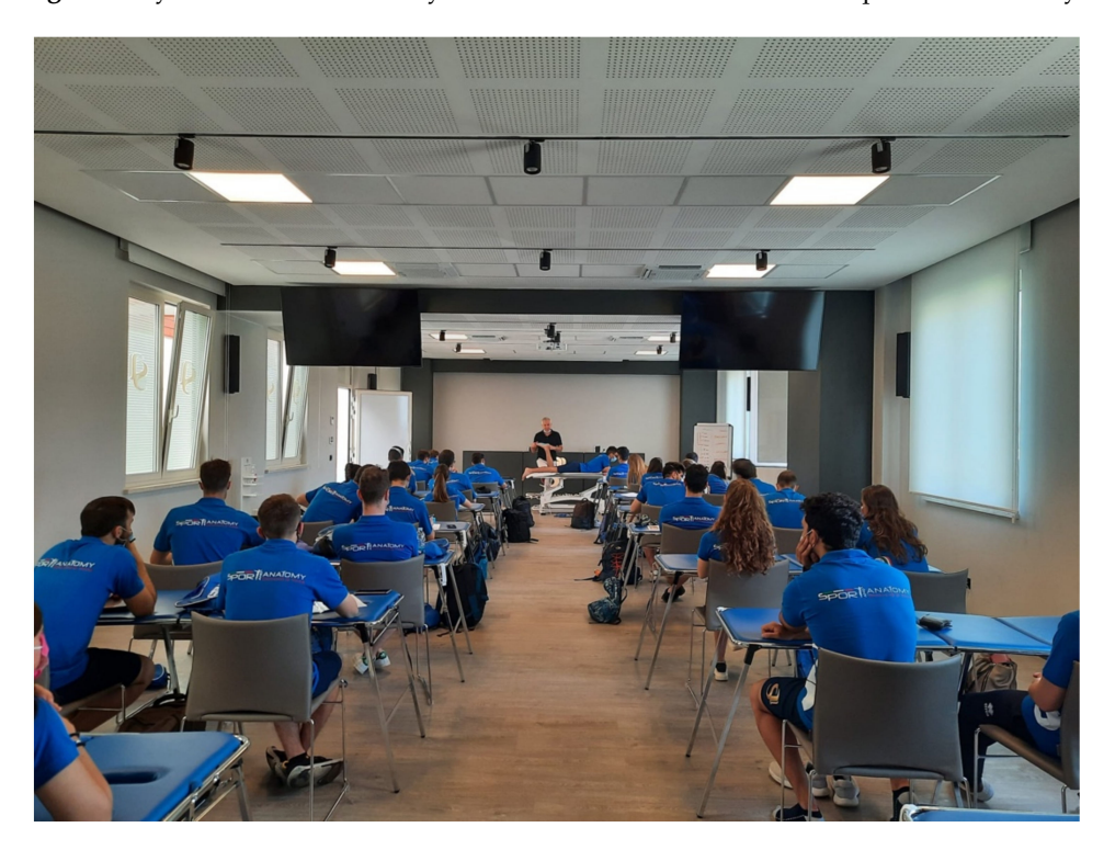
Figure 3. Classroom for lessons and meetings of the Center for Physical and Rehabilitation Medicine "Sport and Anatomy".

Since social media is also important in sports education [6], students and all staff members are also organized on dedicated digital platforms, which are useful not only for a mere exchange of information, but also to plan specific teaching and learning programs. The recent COVID-19 pandemic forced the academic world to address educational activities to digital media, creating new opportunities and experiences for students. Moreover, the most popular social networks are recruited to disseminate the different activities.