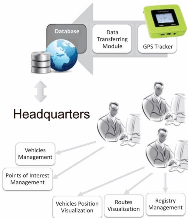
Fig 4.1: A general scheme of a GPS Tracker based monitoring system.