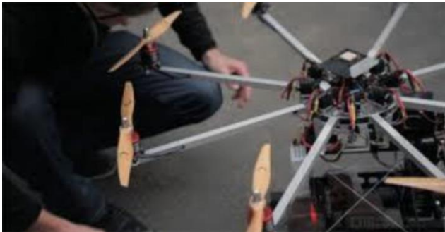
Fig 5.2: Sample small drone.