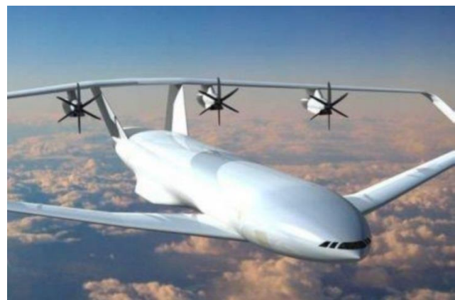
Fig 5.1: Sample large drone.

The drones, now consolidated by the extensive use for military purposes, are increasingly being used for civil applications, such as in operations for prevention and intervention in fire emergency, for use of non-military security, for surveillance of pipelines, with the purpose of remote sensing and research, often at a lower cost compared to conventional aircrafts [26]. In recent years, the technologies related to the development of the drones have undergone a rapid surge. In particular, the technological development in the field of cameras allows equipping a drone with multiple sensors, in the visible spectrum (compact or professional digital cameras) [27], infrared (thermal imaging), multi-spectral, till more advanced sensors, such as LIDAR [28] or sensors for monitoring the air quality.