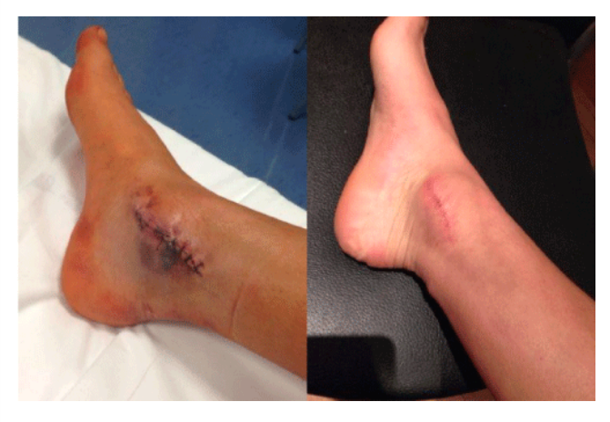
Figure 3: Clinic at day 2 and day 15.

The high incidence of ankle lesions reveals a correlation with the use high-cut and hard-fit skating boots that force the foot and the ankle to perform a partial plantar flexion movement changing the joint biomechanics and function [3-9].