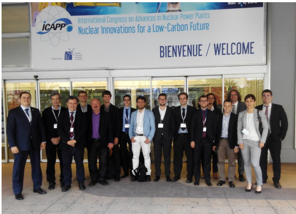
Figure 2. Group picture at the PhD Event held at the ICAPP Conference in May 2015

Another relevant own activity of ENEN is the PhD event and prize, whose last edition was celebrated at the International Congress on Advances in Nuclear Power Plants (ICAPP) 2015 in Nice, France, 5-6 May, 2015.