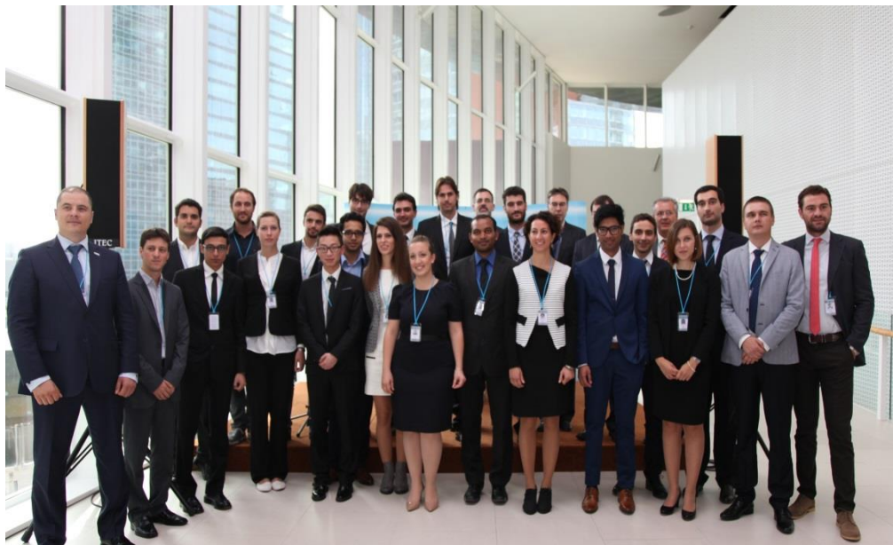
Figure 1. Group picture at the EMSNE Award Ceremony held at IAEA in September 2015

In 2015 the engineers who have received the certification have been 26. The related Diplomas were awarded during a Ceremony held in the beautiful atmosphere of the IAEA Vienna International Center, as a side event of the 59 th IAEA General Conference (Figure 1). For 2016, 29 candidates have been already proclaimed at the General Assembly of ENEN, held in Geel at the Headquarters of JRC-IRMM.