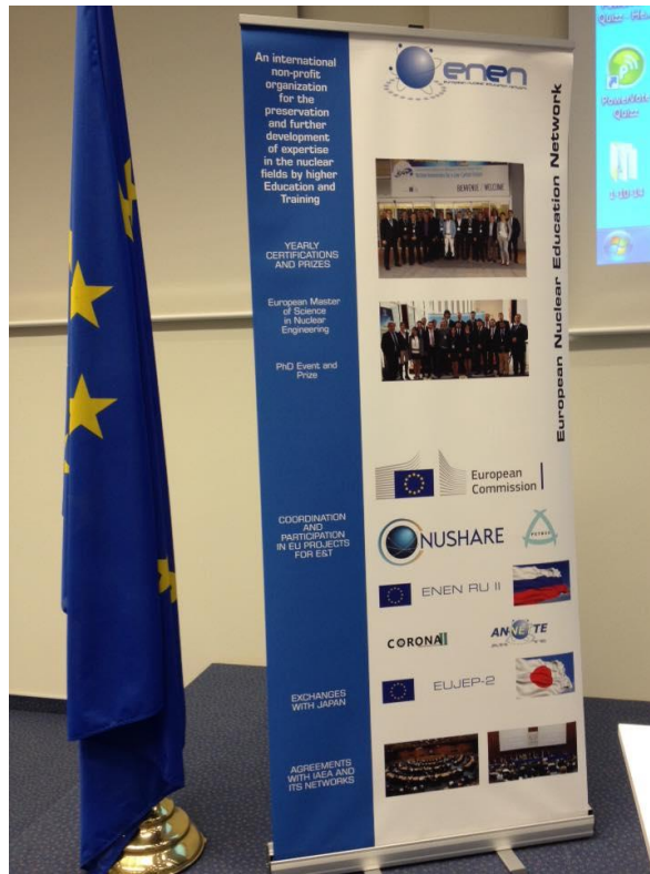
Figure 3. Roll-up collecting the logos of ongoing ENEN activities and projects

The recent involvement in the project of the European Nuclear Society, of INBex and of the World Federation of Science Journalists is bringing more momentum to the ongoing actions, initially carried out only by CEA-INSTN, ENSTTI, Universidad Politecnica de Madrid, Tecnatom and ISaR, under the Coordination of ENEN.