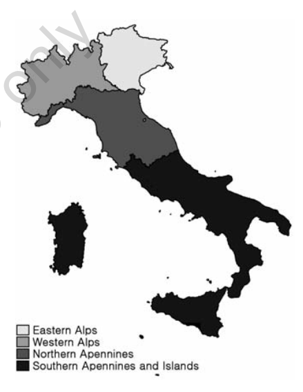
Figure 1. Subdivision into macro-regions of Italy.

Data available for wild boar, in part of the Northern Apennines and most of the Southern Apennines and Islands, are incomplete owing to a lack of hunting statistics by regional and provincial offices, and are probably underestimated. With this caution, two thirds of total wild boar culling is produced in the Northern Apennines, less than 20% in the Southern