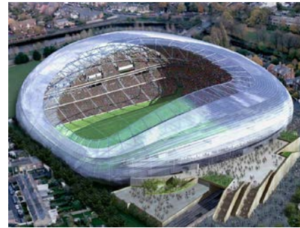
Fig. 4 HOK and Buro Happold Lansdowne Road Stadium, Dublin

Part of the current architecture is an architecture characteristic of the new digital dimension of the Information Age. An architecture not only narrative and metaphorical, but effectively interactive