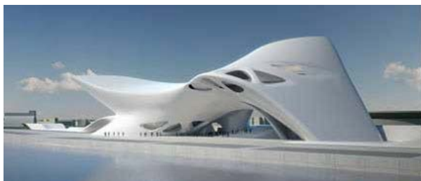
Fig. 3 Nuragic and contemporary art museum, Hadid, Cagliari, Italy

If we observe some examples of this architecture we note that the electronic model it is not just a tool for studying, testing, simulating and constructing. The design concept can born from the nature of the digital resource.