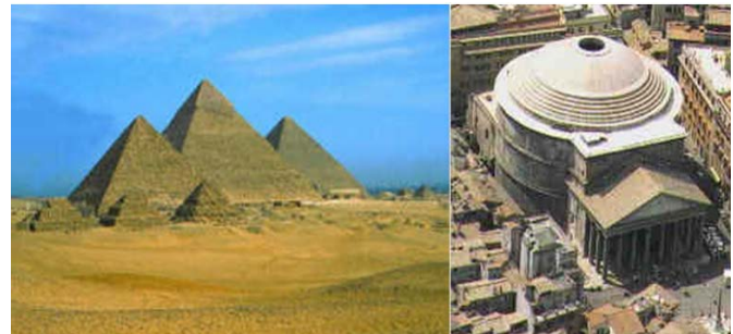
Fig. 1 Icons of Architecture’s geometries: Pyramids and Pantheon

The architecture of Pantheon is a picture of the power of geometry. The geometry was the base of the constructive representation of this building 1