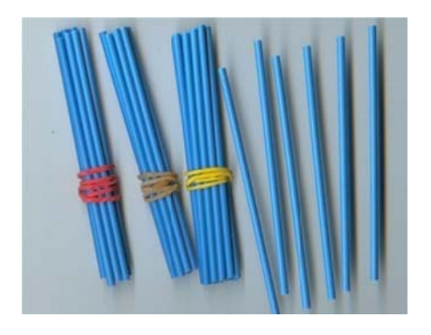
Fig. 2: Representation of the number 36 with straws in bundles of ten

One of the artefacts introduced in first grade consists of straws that students learn to bundle up in groups of ten, through a process of discovery.