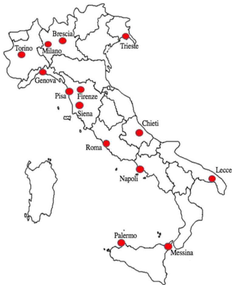
Fig. 1 Italian Pediatric Rheumatologic Centers

familial cases in 12% of our patients. Average age at onset was 8.34 \pm 4.11 years and average age at diagnosis 11.29 \pm 3.95 years. All patients were Caucasians.