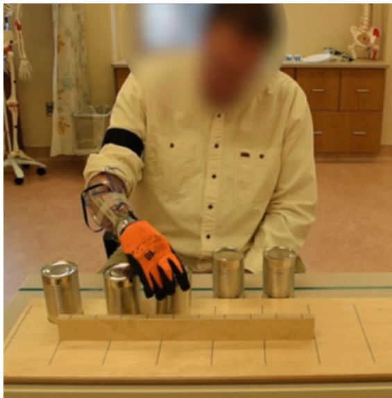
Fig. 1 A subject performing one of the Jebsen Taylor test of Hand Function subtasks

As mentioned above, the Pisa/IIT SoftHand was initially designed as a robotic hand intended for use on humanoid robots. The embodied intelligence of the SoftHand's mechanics suggested it had potential as a prosthetic hand that would not require complex control input from the user. In order to test this theory, it first had to be modified to be more suitable for prosthetic applications. In particular, the overall size of the hand was reduced to better approximate a large male hand. Further, the electronics were reduced in size, modified to interface with commercial electrodes (Otto Bock, Germany), and moved to the back of the hand to create a more compact design. To better interface with a prosthetic socket, a quick disconnect style wrist component was developed that allowed manual pronation and supination; further, the wrist was flexibly connected to the SoftHand Pro to allow passive wrist flexion and extension. Finally, a smaller and lower voltage motor was incorporated to allow use of a smaller, lighter-weight battery. For each subject, a custom prosthetic socket was built by a certified prosthetist.