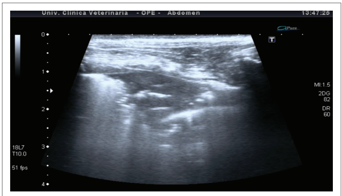
Figure 3: Shred sign image in a patient with pneumonia. It is possible to notice the peripheral pulmonary consolidation with irregular reverberation areas and central air bronchogram.