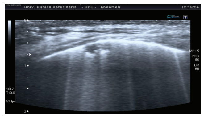
Figure 4: US detection of B-lines associated with irregular, thickened pleural line and sub-pleural consolidations in a patient with ARDS (compare with Figure 2).

Alveolar consolidation was revealed in eight patients and the final diagnosis was aspiration pneumonia in all subjects. Inspiration pneumonia appeared by ultrasound as an alveolar consolidation with pointed or linear dynamic air bronchogram and peripheral shred sign. The right middle lobe was involved in 7/8 cases, and the ventral portion of the cranial lobes in 4/8.