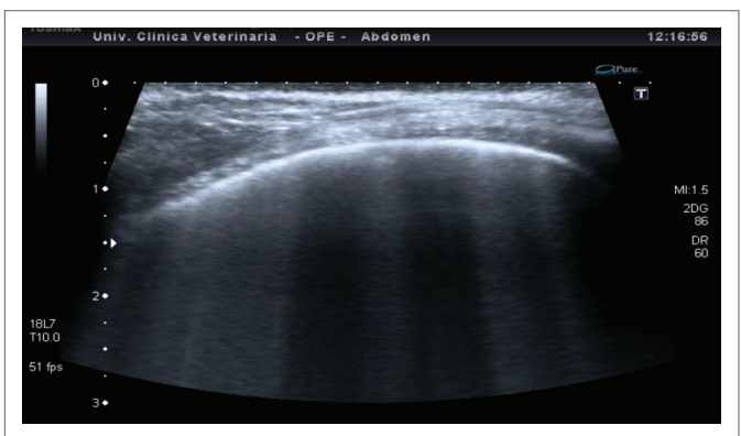
Figure 2: Thoracic wall; starting from the pleural line some hyperechoiclines (B-lines), due to ring down artefacts, are evident; pleura is regular and not thickened in a patient with cardiogenic pulmonary edema