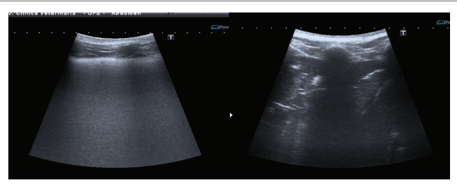
Figure 5 : Anticoagulants intoxication in a dog; (left) day one, note the presence of confluents B-lines that provides white lung aspect. (right) day two, modification of the image with pulmonary consolidation and air bronchogram.

In our study, PLUS proved to be an efficient, safe, feasible method. The highly diagnostic accuracy aided the diagnosis of pleuro-pulmonary diseases in acute dyspnoic patients. Finally, thoracic US are easily repeatable, allowing the patient to be closely monitored several times a day while in the intensive care unit. The real time ultrasound image evolves rapidly, and ultrasound can be used to monitor treatment responses during patient follow-up. The patients enrolled in this study with cardiogenic pulmonary edema were treated with diuretic