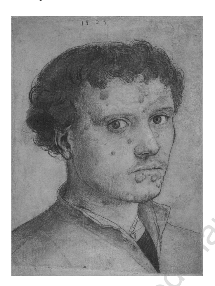
Figure 1. Holbein the Younger. Portrait of Ulrich von Hutten, 1523 (with permission of the Harvard Art Museums/Fogg Museum, Bequest of Paul J. Sachs, "A Testimonial to my friend Felix M. Warburg").