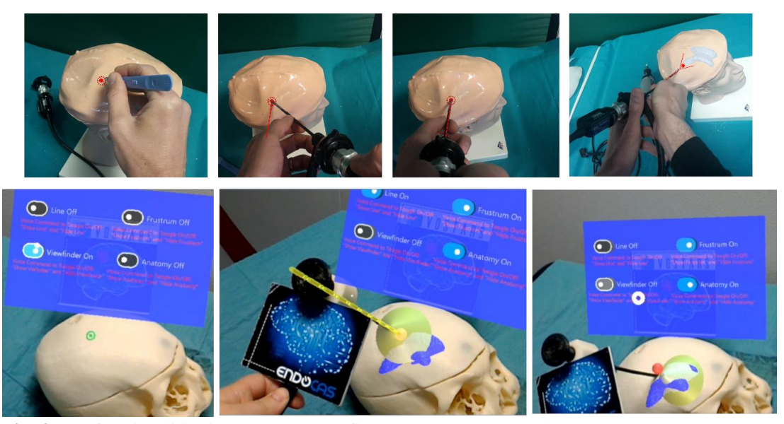
Fig. 2. AR functionalities in neurosurgery - first row: concept; second row: early (Microsoft Hololens based) demo implementation to define surgical needs and study feasibility. a) viewfinder visualization b) endoscope trajectory and frustum towards anatomy, c) frustum and anatomy visualization