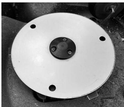
Fig. 1. Cutting disc of the ordinary autonomous mower. Note the stainless loose disc and the pivoting cutting blades underneath.

The prototype autonomous mower was obtained by modifying a second autonomous mower (Automower 310) to achieve lower mowing heights, ranging from 0.3 to 4.0 cm (Figs. 1 and 2). Because of its manual mowing height adjustment, this autonomous mower was the most appropriate machine to start with to obtain the low-mowing prototype. In fact, manual adjustment enables the mowing height to be changed with a continuous variation, allowing even for the slightest adjustment. The first modification was to build a 2-cm spacer to lower the cutting disc. The spacer was placed between the shaft coming from the cutting disc engine and the cutting disc itself. The spacer was built from a piece of alloy and lathed to obtain a lightweight and reliable component. The second modification was to remove the loose stainless steel disc placed under the cutting disc. The purpose of the loose disc was to save energy by preventing the grass from coming into contact with the revolving cutting disc. After the spacer was mounted, the loose disc became an obstacle to low mowing as it touched the ground before the cutting disc, thus, the cutting disc could not get lower than 1.1 cm. Removing the loose disc allowed the cutting disc to almost reach ground level, and thus to cut at (theoretically) 0.3 cm. The third modification was to stop the three small blades from pivoting by changing the type of screws used to