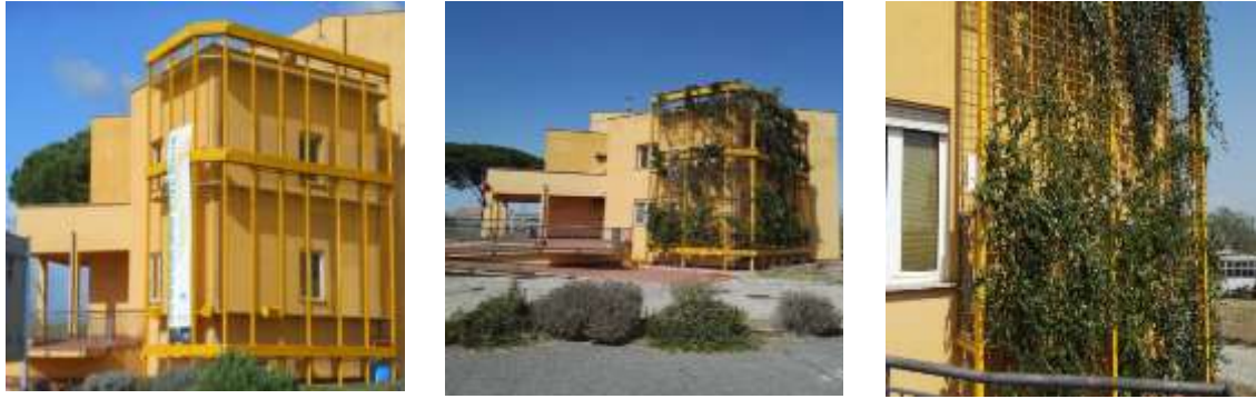
Figure 1. Green wall prototype installed at the ENEA Casaccia Centre.

The data were measured at a frequency of 60s, averaged every 15 min and stored in the data logger, by a pyranometer (CMP6-L, Campbell, Logan, UT, USA) for the solar radiation, and by Rotronic-Hygroclip-S3 sensors for the external air temperature. The temperature of the external plaster surfaces exposed to the solar radiation was measured using thermistors (Tecno.El S.r.l., Rome, Italy).