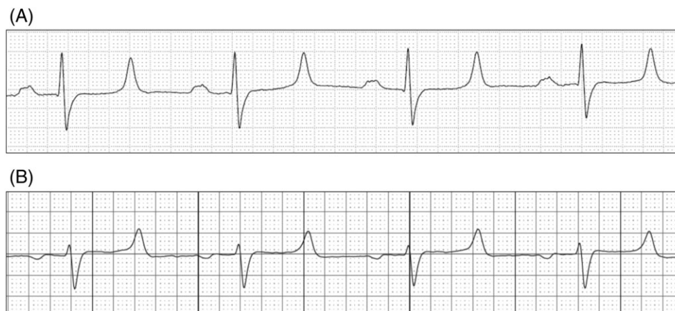
FIGURE 2 Standard ECG (A) and smartphone ECG (B) tracings in a cow. Paper speed = 50 mm/s (A and B); gain = 10 mm/mV (A) and 20 mm/mV (B).

Median, minimum, and maximum values for the duration of P wave, PR interval, and QT interval obtained with the standard ECG and the smartphone ECG methods are reported in Table 1. The evaluation of P wave duration measured on standard ECG and smartphone ECG showed a bias of 10 milliseconds (95% limits of agreement: -17, +38 milliseconds; Figure 3C), PR duration had a bias of 7 milliseconds (95% limits of agreement: -20, +34 milliseconds; Figure 3D), and QT duration showed a bias of -4 milliseconds (95% limits of agreement: -36, +27 milliseconds; Figure 3E). On the standard ECG tracings, P polarity was positive in 48 of 49 (98%) cases and negative in 1 of 49 (2%) cases. On smartphone ECG tracings, P polarity was positive in 5 of 49 (10%) cases, negative in 39 of 49 (80%) cases, and it could not be determined in 5 of 49 (10%) cases. A poor agreement ( k = 0.006 ) was found between standard and smartphone ECG for P polarity.