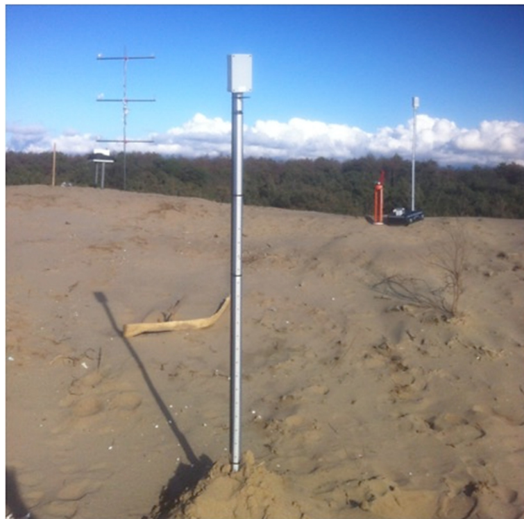
Figure 4. A section of the deployed WSN

A portion of the WSN can be seen in Figure 4. The central Sand Level Node can be seen in the foreground while the top Sand Level Node together with the Sand Collector Node can be seen in the background. The Environmental Monitoring node and the Gateway node are visible.