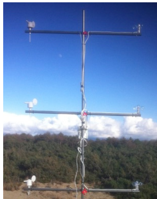
Figure 3. The Environmental Monitoring Node

The system was tested for a period of 24 hours. The sampling rate of the Environmental Monitoring Node was set at one sample each 20 minutes. As previously stated, wind speed and direction was calculated directly on the Arduino Uno Board and then a packet made up of the six data (three speeds and three directions) was sent to the Gateway.