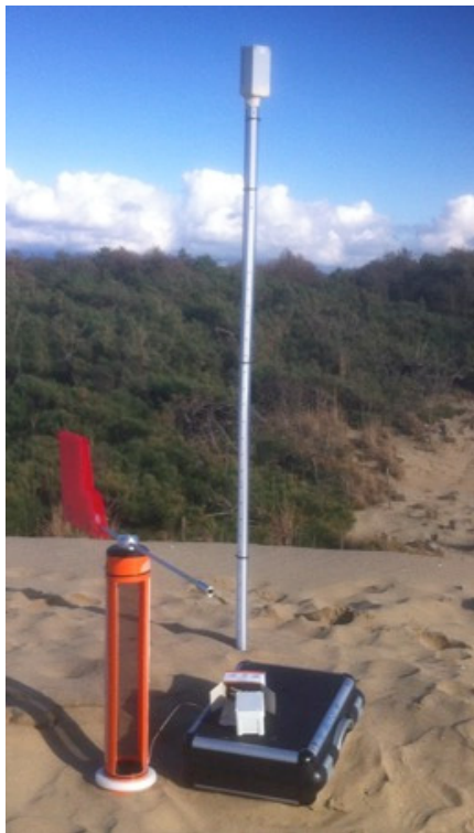
Figure 2. The Sand Collector Node (on the left) and the Sand Level Node (on the right)

The proposed architecture was tested in March, 2016 on the sand dunes located in the San Rossore regional park, Pisa, Italy. For the tests, 5 nodes WSN was set up: this included three Sand Level Nodes , one Sand Collector Node and one Environmental Monitoring Node . The three Sand Level Nodes were arranged in line, perpendicularly to the beach, 10 meters apart from each other. The Sand Collector Node was positioned close to the top Sand Level Node. The Environmental Monitoring Node was positioned on the top of the sand dune 5 meters apart from the top Sand Level Node. The Gateway Node was positioned close to the Environmental Monitoring Node.