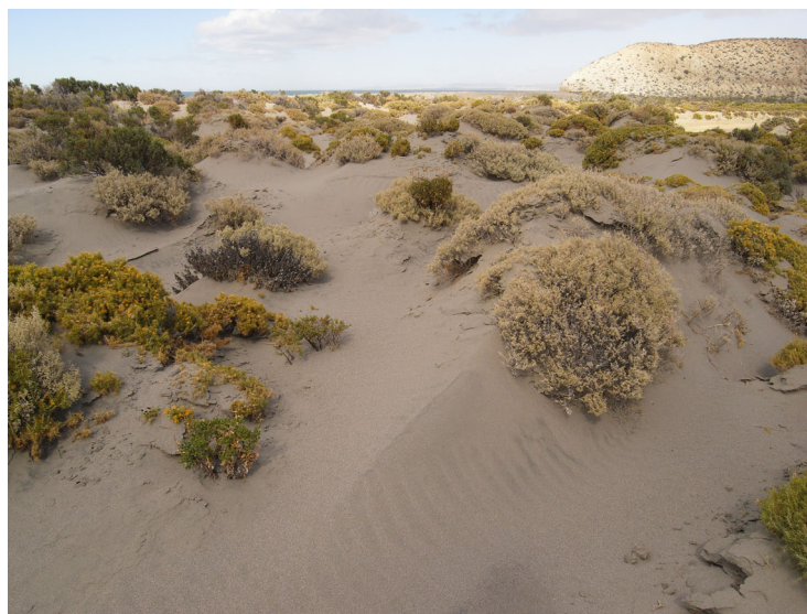
Figure 7. Dunes in Península Aristizábal.