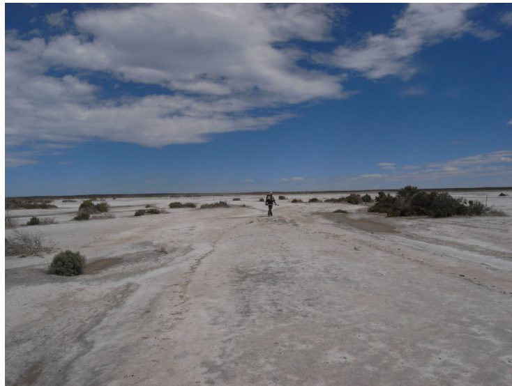
Figure 4. Salitral near the village in Bahía Bustamante.