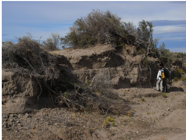
Figure 6. Stabilized dune covers fluvial deposits in Cañadón Restinga.