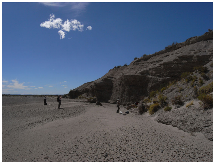
Figure 5. Section in marine deposits along the Cañadón Malaspina.

high concentration of organic material. Generally they are covered by typical halophyte plants.