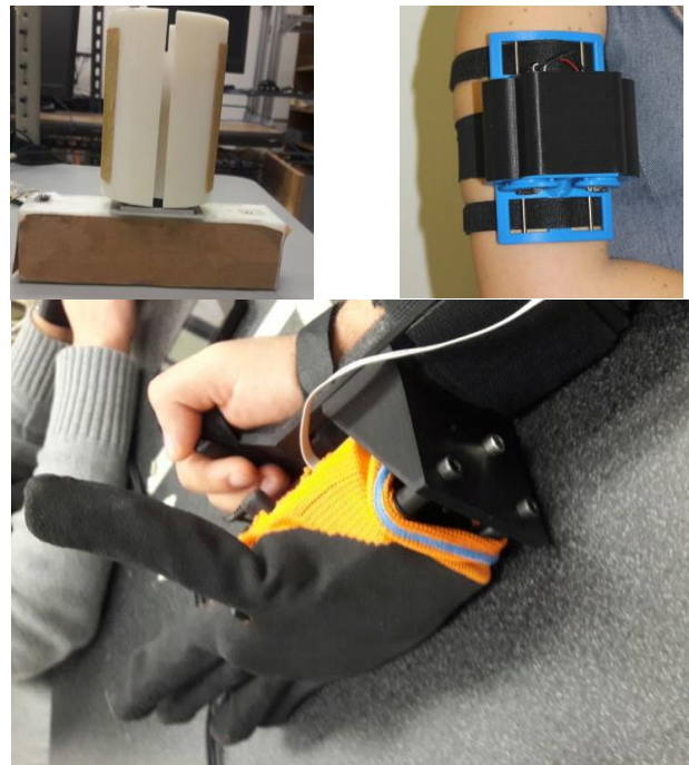
Figure 1. Clockwise from top left: the inverted-T sensorized object, the CUFF, and the SoftHand Pro with the forearm adapter.