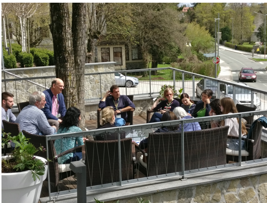
Figure 7.2: Discussions on plant UV research in ecology and plant production science led by P.W. Barnes.