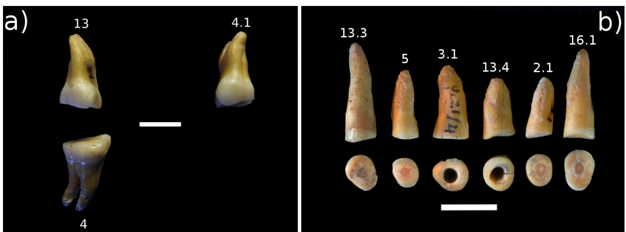
Fig. 5 - a) Dental remains assigned to individual 4; b) dental remains assigned to individual 5. Modified after Oxilia et al. (2017).