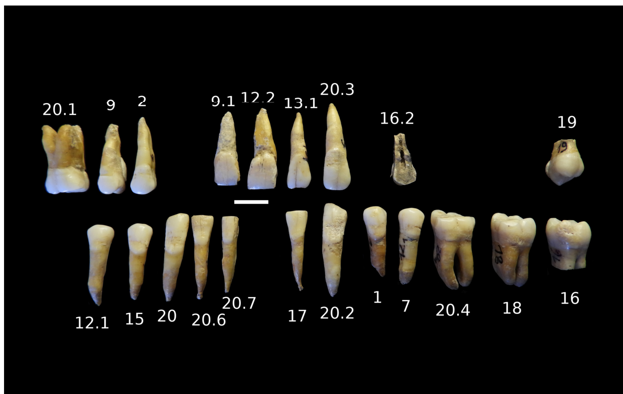
Fig. 6 - Dental remains assigned to individual 6.

have been assigned to individual 6. Individual 4 and 5 are considered separate individuals, but it is reasonable to assume that they are from the same individual on the basis of dental wear since anterior tooth wear is generally far more advanced than molar wear in hunter-gatherers (Willman, 2016). Nonetheless, we cannot securely attribute these remains to the same individual due to the high level of fragmentation.