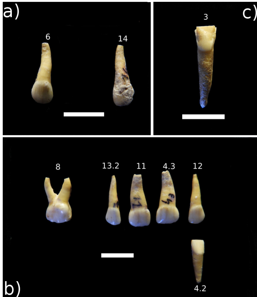
Fig. 4 - Dental remains assigned to individual 1 (a), to individual 2 (b), and to individual 3 (c).