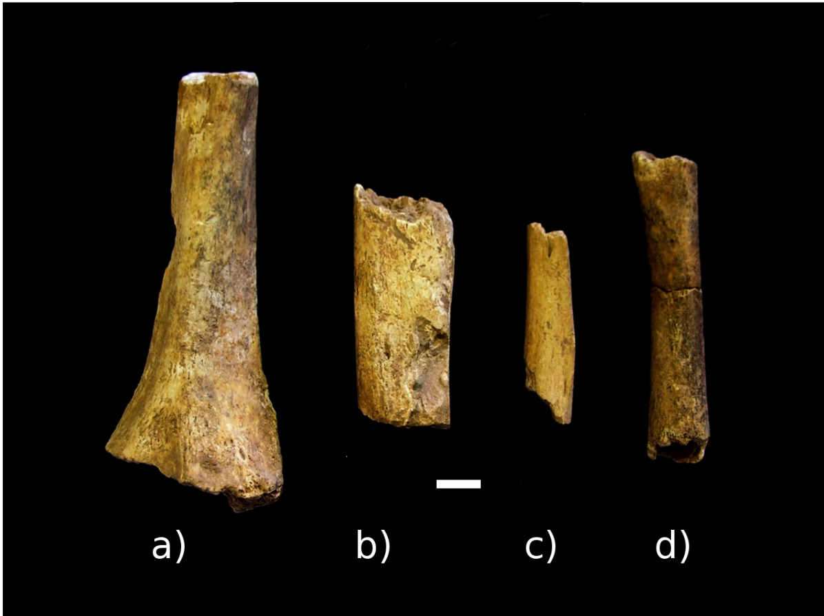
Fig. 3 - Post-cranial remains from Riparo Fredian. a) and b) fragments of a distal humerus; c) fragment of a diaphysis of an ulna; d) fragment of a posterior limb of a small ruminant, previously considered to be a sub-adult human femur.

surface of cusp 1 clearly indicates it is a left molar.