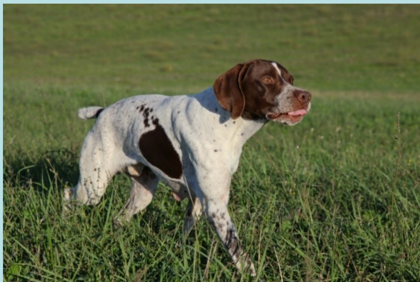
Figure 1: Example of Braque Français, type Pyrénées breed

Copy number variants (CNVs) are an important source of genetic variation complementary to single nucleotide polymorphisms (SNPs). In this study, we used a high-density SNP array (170 K) to detect CNVs in Braque Français, type Pyrénées dogs (BRA) (Fig. 1).