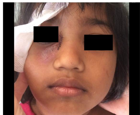
Fig. 2 Physical examination at day 6, after open dacryocystectomy was performed

Compared to adult dacryocystitis, PAD shows a much more rapid progression associated with pain, redness and swelling of the skin over the medial canthal region up to a lacrimal abscess, as in our case. Progressive