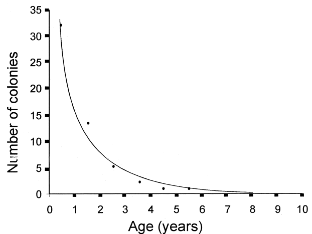
FIG. 1. – Population size structure of Corallium rubrum : the distribution of colonies ( X_a \text{ dm}^{-2} ) into size classes (a) is reported. Points have been fitted by the following power curve: X_i = (46.3 \pm 2.7) e^{-(0.79 \pm 0.03)(i-0.5)}

This curve exhibited a decreasing “monotonic” pattern (each age class is invariably greater than the next) typical of populations in a “steady state” (showing constant mortality and reproduction rates; Chadwick-Furman et al. , 2000). The overall size class structure of the population is also reported in the life table (Table 2). As few colonies within this population fell into the largest classes (6-10), they were grouped into a new class 6 that includes all colonies having a diameter greater than the upper limit for class 5 (4.59 mm). More than 50% of the colonies are in class 1 (recruits), while only few colonies fall into the two biggest classes, 5 and 6.