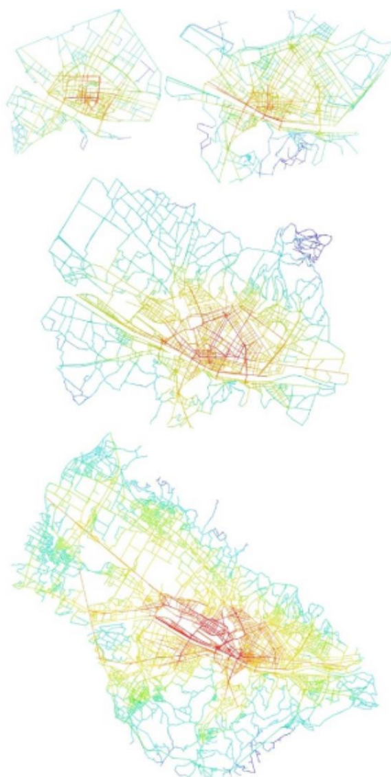
Figure 1 - The distribution of integration value in the grid of

Some evidence emerges from the observation of those results. First, a progressive shifting of centrality, from the geometric centre of the inner core towards the external radial developments, is clearly shown in figure 1: while in