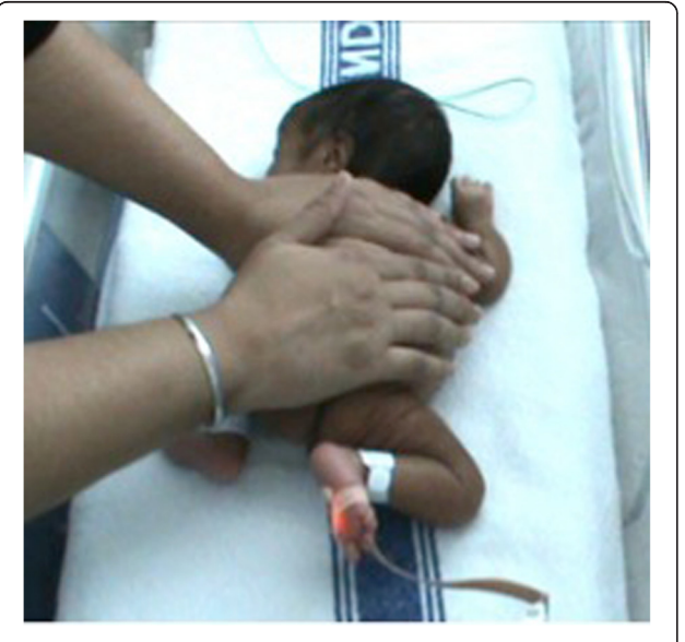
Fig. 1 "Resting hands" prone position in massage protocol

Mothers will be given the following instructions both in demonstration and in written form for later reference. The tactile phase will begin with asking "baby's permission", in the prone position and enclosing the infant with cupped hands in a "resting hands" position (Fig. 1). A small amount of massage oil (cold-pressed fruit or vegetable oil) will be used. Maintaining a "resting hand" to the back, the mother will slowly stroke the baby with the palm of her other hand with a gentle but firm, rhythmic motion, following this sequence: head to the neck