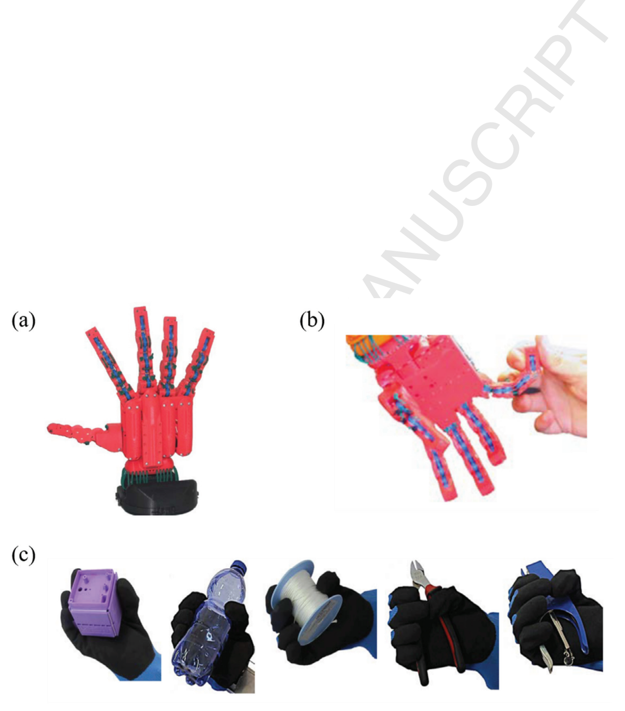
Figure 2: (a) Skeleton of the Pisa/IIT SoftHand advanced anthropomorphic hand prototype. (b) The SoftHand joints can withstand large forces in all directions, thus allowing the hand to automatically return to the initial configuration. (c) Examples of experimental grasps performed with the Pisa/IIT Softhand (Adapted from [109])