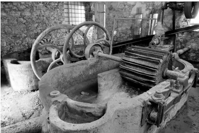
Figure 6 - Machinery for the production of paper, La Buca Paper Mill, Colle di Val d'Elsa.