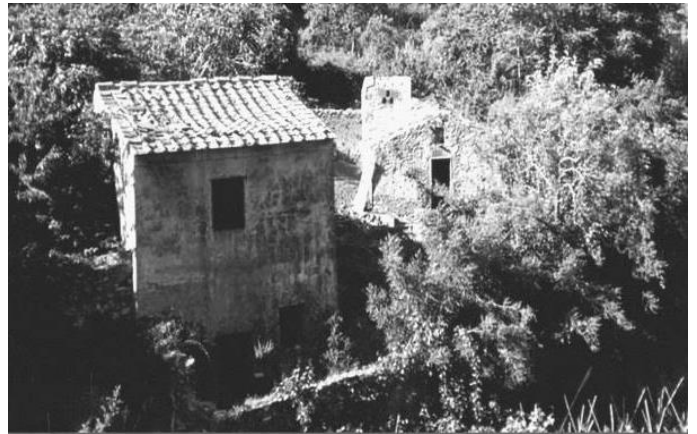
Figure 9. The Lanza millhouse and mill, Rio nell'Elba (photo by P. Pierotti 1993).