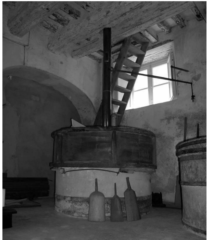
Figure 3. Two of the three millstones from the Gangalandi Mill, Calci.