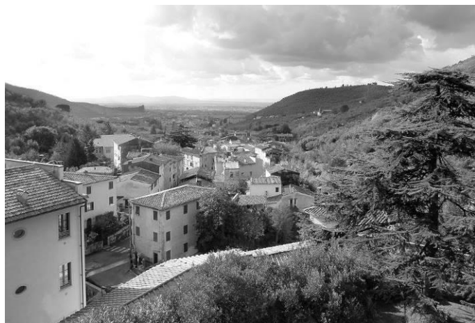
Figure 1. The arrangement of houses in Calci is closely tied to the diffusion of mills.

Among its aims, the Tuscany Region’s territorial plan, which also includes the landscape, includes the “valorisation of the historic-testimonial evidence connected with the water resource and the strongly identifying places along the river, also subsidising for that purpose, projects for the recovery of historic-testimonial artefacts connected with water resources”. The public administration’s intent should not be limited to the concept of not losing the memory of the “strongly identifying places”, but should have a sense of how much and in what way such recovery can be realized, taking a lesson from history and the functionality of such edifices Pierotti & Ulivieri (2009).