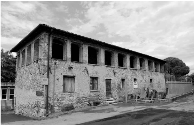
Figure 5. La Buca Paper Mill, Colle di Val d'Elsa.