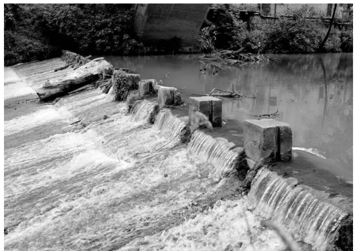
Figure 4. Sluiceway, San Marziale, Colle di Val d'Elsa.