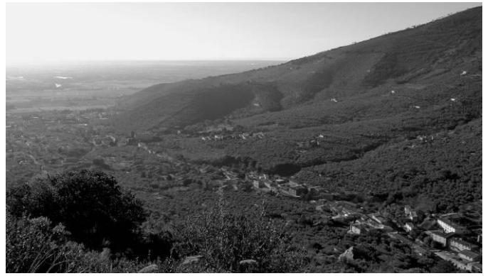
Figure 2. Calci “stands almost at the centre of Monte Pisano, in the most eminent position in the valley” cut through by the Zambra torrent.