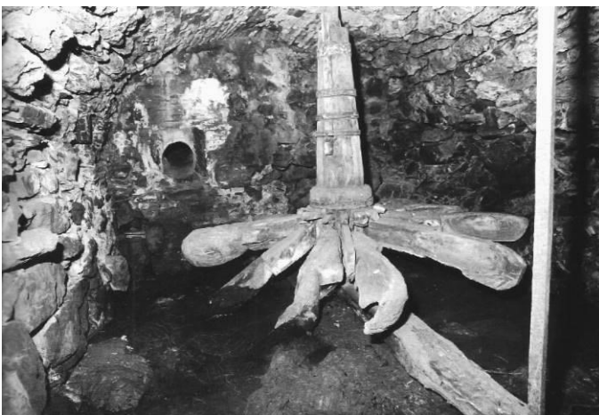
Figure 7. Waterwheel chamber of the Orzali mill: the scooped blades of the horizontal wheel were turned by the jet of water issuing under pressure from the pipe, Rio nell'Elba.