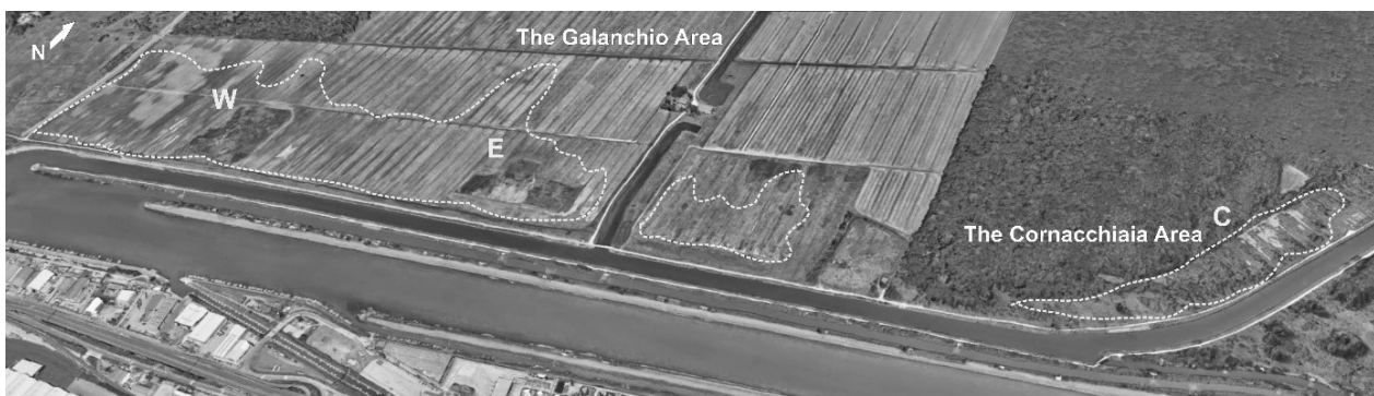
Figure 2. The agro-forested landscape of the study area (dot line indicates areas with saline soils) (Map data 2019 Google Earth Pro).

The cluster analysis showed, with good significance, eleven different brackish plant communities corresponding to eleven association, belonging to five classes (Fig. 3). Detrended Correspondence Analysis, confirmed the cluster subdivision of the detected vegetation, and separated it quite clearly into three groups. These correspond to three different habitats (sensu Directive 92/43/EEC): Habi-