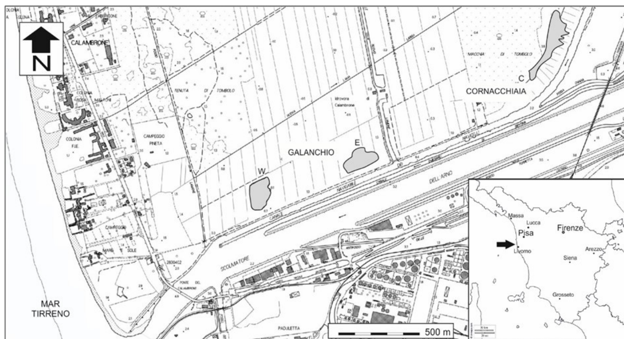
Figure 1. Geographic position of the study area and the three brackish ponds investigated (W, E, C) (Map data Geoscopio Regione Toscana, CTR).

The thermoudogram shows a period of summer drought with water deficit from June to September. Based on the bioclimatic classification of Pesaresi et al. (2017), the study area bioclimate belongs to the Mediterranean