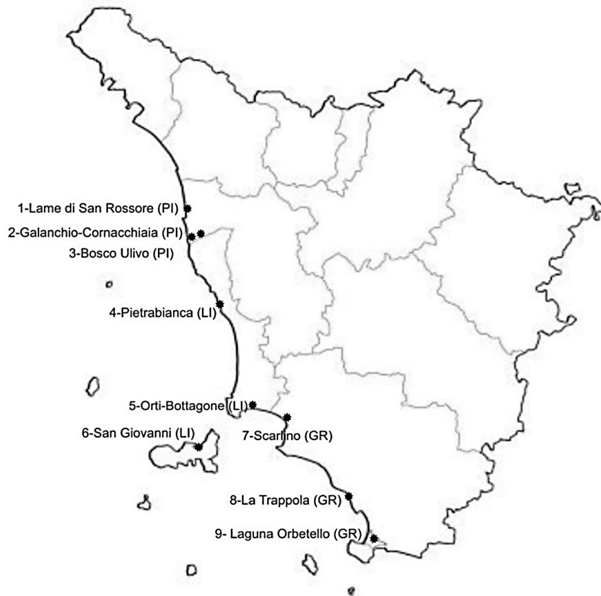
Figure 5. List and distribution of halophilous associations and phytocoenotic communities found to date in the nine main brackish coastal areas known from the literature for of the Tuscan coast.