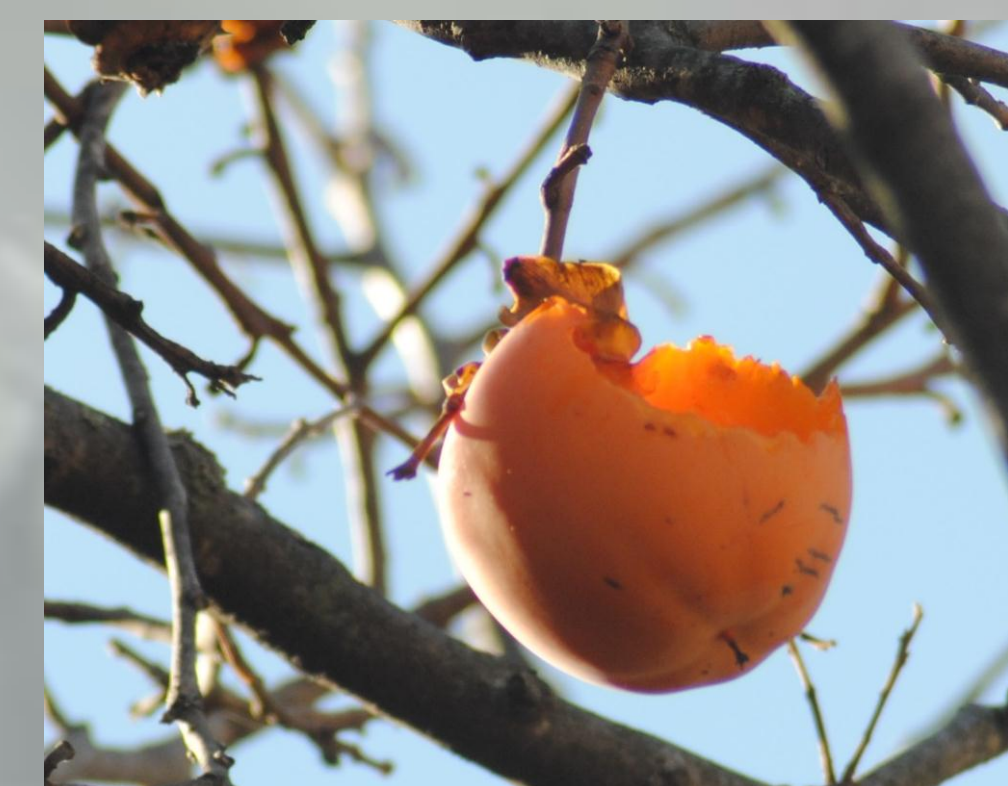
Figure 1: A half eaten orange fruit of Persimmon, 20 th November 2017.