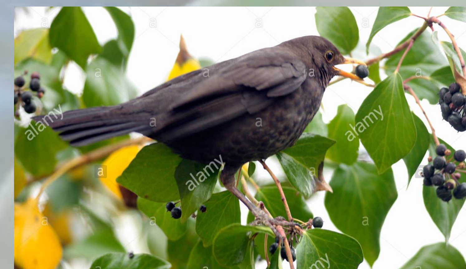
Figure 2: Blackcap feeding on red fruits of Holly (left) and Blackbird on black fruits of Ivy (right).

https://www.sciencephoto.com/media/384199/view/male-blackcap-bird ;