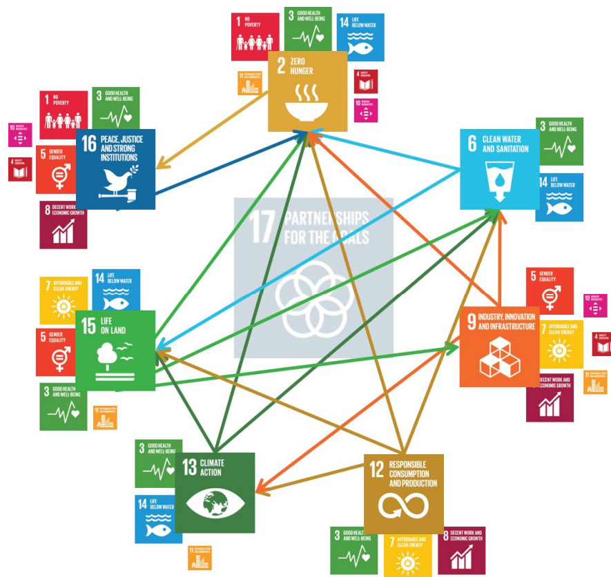
Figure 2. Links between sustainable development goals in the “edible insects’ idea”.

Insect farming, as a new production sector, could surely contribute to reaching several SDGs (Figure 2).