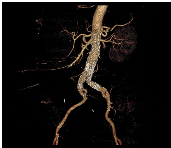
Fig. 1 Postoperative CT-scan after initial EVAR

The postoperative CT-scan showed that the right renal artery was partially covered by the graft (Fig. 3). On the 2nd postoperative day a bare metal stent (RX Herculink Elite Renal Stent System 5 × 15 mm; Abbott CardioVascular, Plymouth, MN, USA) was successfully inserted and deployed via a left brachial access. After 6 months, at Duplex US the aneurysm sac was stable and both iliac extension were patent without any signs of stenosis.