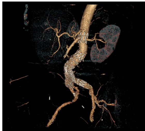
Fig. 2 24-month CT-scan showing disconnection of the bare suprarenal stent from main body stent-graft

The patient gave his consent to the publication of this report.