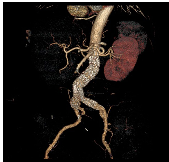
Fig. 3 Postoperative CT-scan after redo EVAR

EVAR is a minimally invasive modality for AAA treatment associated with a reduced perioperative mortality rate compared to open repair. EVAR has become the preferred approach for the treatment of infrarenal AAA; however, long-term follow-up suggests that the survival benefits from EVAR are lost due to higher rate of reinterventions [1].