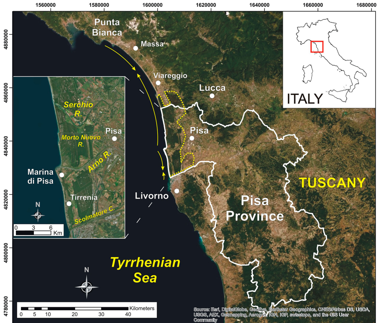
Figure 1. Location map of the study area. The yellow lines represent the direction of the littoral drifts along the Northern Tuscany littoral cell. The yellow dotted line outlines the area belonging to the Migliarino – San Rossore – Massaciuccoli Regional Park.

website (Tuscany Region geo-portal) allowed the employment of a detailed Digital Terrain Model (DTM) of the study area as source data for map construction/realization. The LASER (Light Amplification by the Stimulated Emission of Radiation) scanner acquisition enables the production of Digital Elevation Model (DEM) even of the 'bare' ground surface (DTM), in which any other feature lying on the terrain (e.g. trees, building, etc.) has been removed. The use of DTM rather than DEM is essential for morphologic investigation, especially in densely vegetated areas as in the case of the Arno River delta. LiDAR data (i.e. x,y,z points cloud) that produced the DEM used in this work have been acquired with a LASER airborne survey between 2008 and 2009 by MATTM (Ministero dell'Ambiente e della Tutela del Territorio e del Mare). DEMs provided from MATTM display 1 \times 1 m or 2 \times 2 m ground resolutions and planimetric and altimetric accuracy of \pm 30 cm and \pm 15 cm, respectively. Enhancement techniques were applied within GIS environment to the LiDAR DTM raster visualization in order to obtain