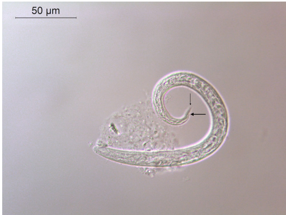
Fig. 3. Filaroides hirthi first stage larva detected at the microscopic examination of the BALF (40x magnification). Note the straight tail with a single slight dorsal indentation (thick arrow), ending into a lance-like shape (thin arrow), consistent with F. hirthi .

opacities with patchy distribution, and direct microscopic examination of BALF revealed once more the presence of live F. hirthi L1s. Thus, fenbendazole treatment (50 mg/kg per os for two weeks) combined with three subcutaneous off-label administrations of ivermectin (0.4 mg/kg, once every two weeks; Ivomec®; Merial), were performed. One month later, the thoracic CT showed normal lung patterns, and no larvae were detected at two BALF microscopic examinations performed one month apart.