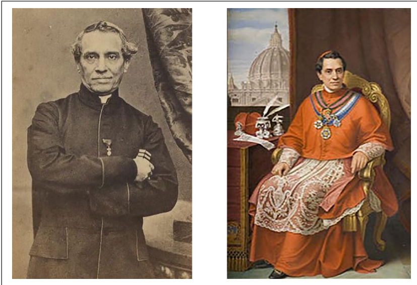
Figure 3. Antonelli pre- and post-Cardinal.

Examples of monitoring that Antonelli implemented were Pope Pius IX's 1850 auditing reforms, establishing the rules for the functions and related competences of the State Council which took the place of the Congregation of Review. It was required to undertake the following financial tasks: