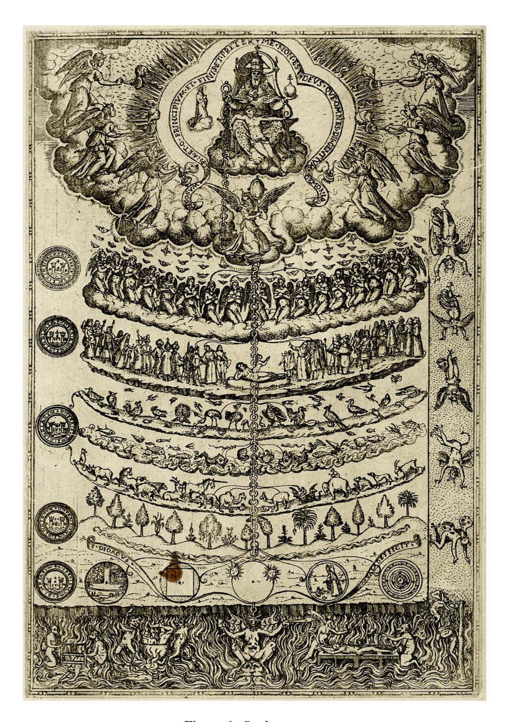
Figure 1: Scala naturae

all species implies that all traits which we consider uniquely human, from intelligence to emotions, to the ability to communicate, to attachment to loved ones, are actually shared with other animals.