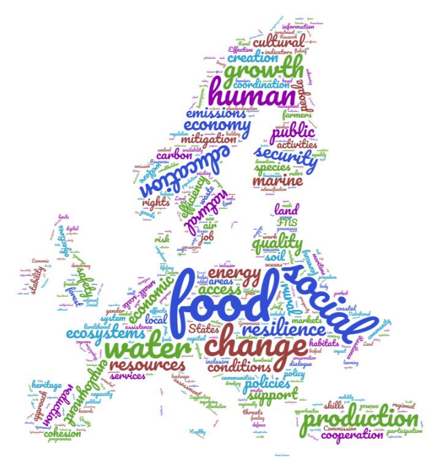
Figure A1. Sustainability key words cloud

Moreover, per each policy act some key words with respect to the socio-economic and environmental components of sustainability are reported. The key words are extracted from the text of the document, or documents, relevant for the act. They are meant to show the specific aspect, or aspects, of sustainability the analysed acts touch upon (Figure 1).